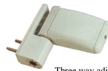
Three way adjustable flag hinge

PLEASE NOTE THAT WITH THE 70MM OUTERFRAME THERE IS ONLY 7MM OF COVER ON THE HINGE SIDE SO WE RECOMMEND YOU FIT A 25MM EXTENSION ON THE HINGE SIDE.